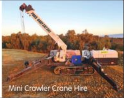
Mini Crawler Crane Hire