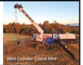
Mini Crawler Crane Hire