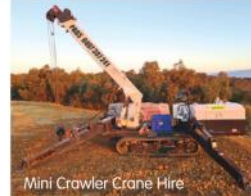
Mini Crawler Crane Hire