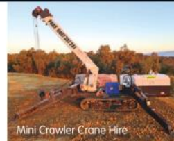
Mini Crawler Crane Hire