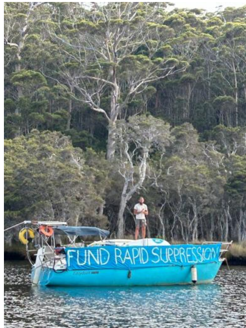
Luke Gaches of Nornalup uses his boat and banner to make an eye-catching backdrop for the peaceful protest (23/3) to save long-unburnt Tingle Forest

The State government's plan to burn the southern portion of Douglas Hill, in the Walpole Nornalup National Park, will turn this long-unburnt open parkland forest into a dense and degraded regrowth area.