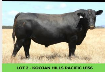
LOT 2 - KOOJAN HILLS PACIFIC U156