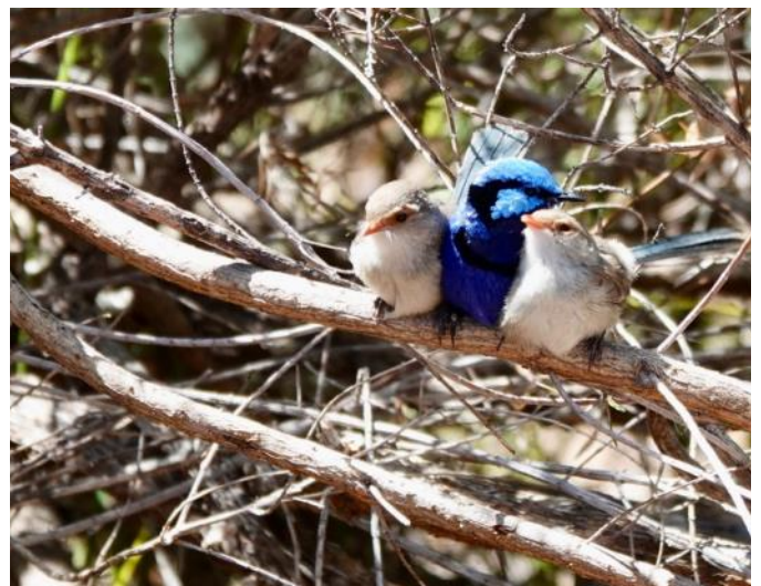
Male Splendid Wren and two of his harem

Be sure to email your photos to weekly@walpole.org.au