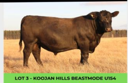
LOT 3 - KOOJAN HILLS BEASTMODE U154

Online catalogue and videos at www.koojanhillsangus.com