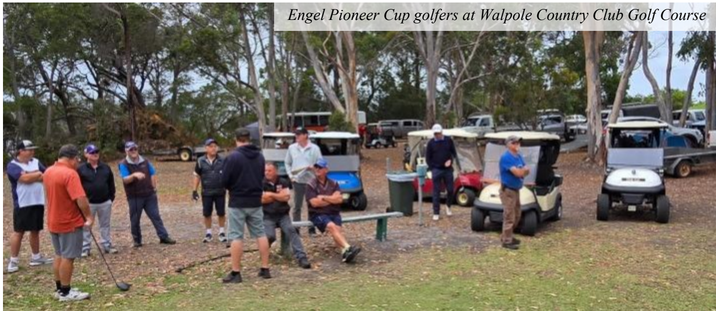
Engel Pioneer Cup golfers at Walpole Country Club Golf Course

The event brought together players from across the southwest - from Esperance to Perth, Bunbury, Wagin, and Albany, showcasing the spirit and community of our golfing family. 214 Players took part in the Engel Pioneer Cup.