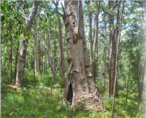
Old-growth tingle forest in Walpole-Nornalup National Park, soon to be incinerated in DBCA's prescribed burn FRK_099 Nornalup.