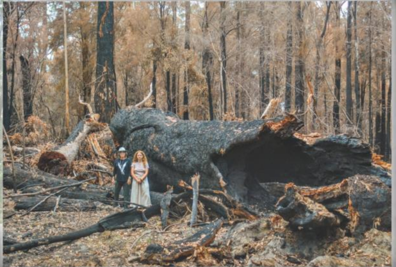
One of the massive old tingle trees DBCA burnt to the ground in its prescribed burn in Giants forest block near Nornalup in December 2024.

Any day now, the Department of Biodiversity, Conservation and Attractions (DBCA) will set fire to this beautiful tingle forest on the banks of the Frankland River, opposite Nornalup, in Walpole-Nornalup National Park.