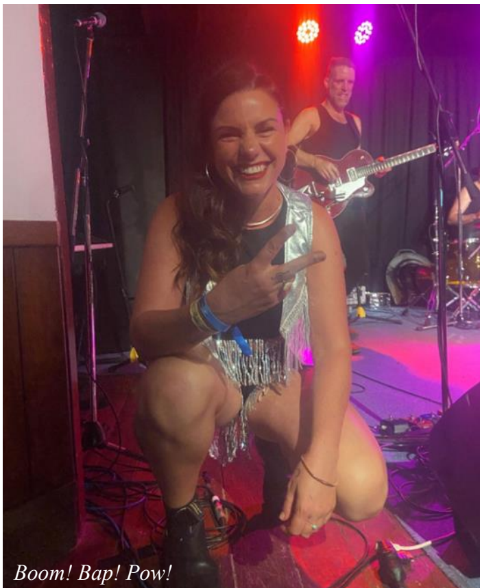
Boom! Bap! Pow!

We started our evening at The Amphitheatre, the festival's main stage, where Salt and Steel had the crowd on their feet, dancing and singing along.